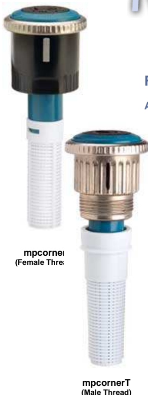
mpcornerI (Female Thread)